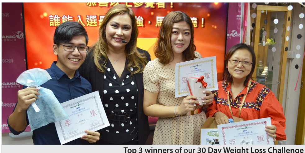
Top 3 winners of our 30 Day Weight Loss Challenge